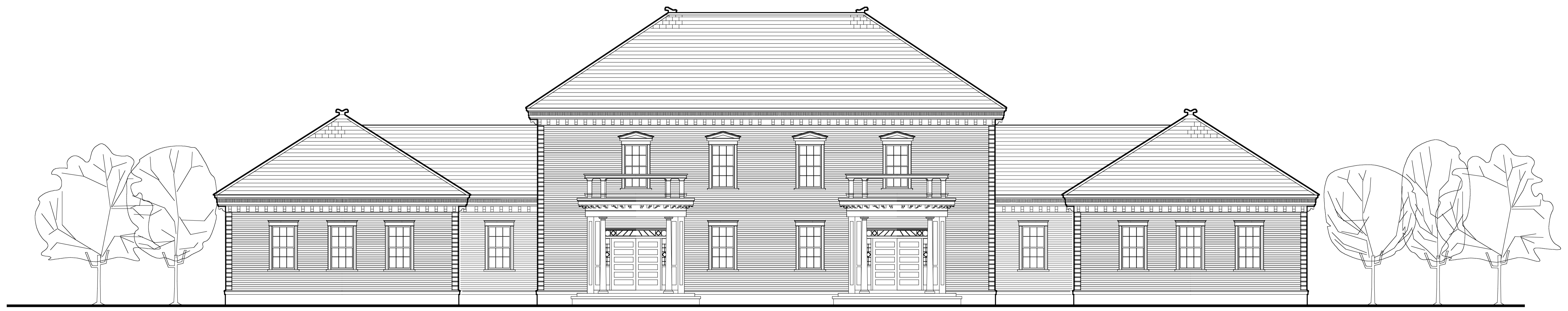
2 WEST ELEVATION Scale: 1/8" = 1'-0"